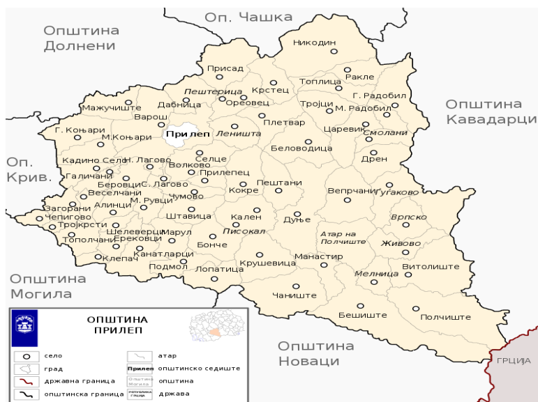
Map 2.: Cartographic representation of the settlements and their atari in the municipality of Prilep