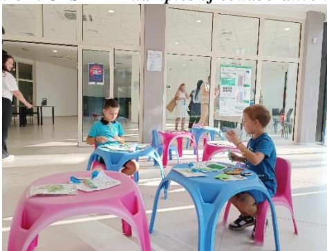
Figure 2. CPSBB - Examples of collaborative work

All of these activities and observations were part of the European Researchers' Night events held between 2018 and 2023, as well as the K-TRIO project ( https://night.nauka.bg/ ), which focused on fostering interdisciplinary collaboration between science, education, and innovation. These initiatives played a key role in promoting public engagement and knowledge-sharing across the community, bridging gaps between scientific and artistic domains.